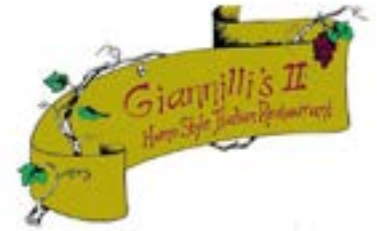
We partnered with Ginnilli's II to send dinner to the Mutual Aid first responders