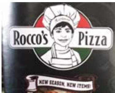
We partnered with Rocco's Pizza to send pizza to the Youngwood Shop 'n Save employees