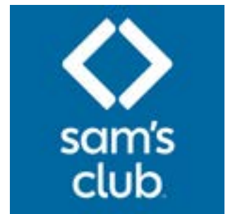
We partnered with Sam's Club to send snacks to the staff of Westmoreland Manor