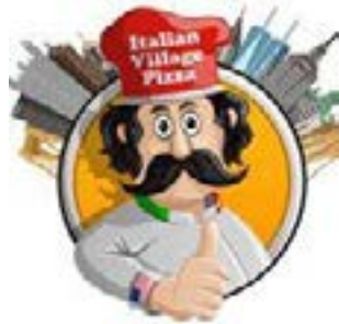
We partnered with Italian Village Pizza to send pizza to the Eastgate Giant Eagle employees