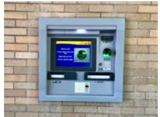
BRAND NEW ATM Our brand new drive-up ATM allows you to withdraw, deposit, check your balance, and more, 24 hours a day, 7 days a week!

Sept 7 Labor Day All Pheple FCU branches and offices closed.