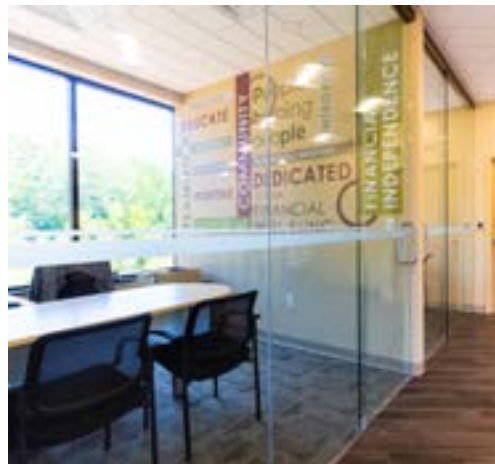
OFFICES Three bright, sunny offices provide our members privacy when they need it.