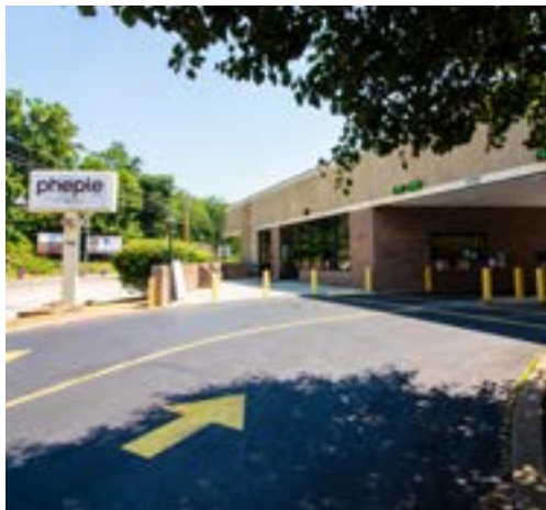
NEW EXTERIOR We moved the front door and replaced the front windows to improve accessibility.

The office will be open for walk-in teller transactions, normal business hours, beginning July 13. Hours are Monday to Thursday, 9am to 5pm, Friday, 9am to 6pm. Saturday hours, 9am to 1pm, will remain drive-thru only. The branch is located at 708 Route 119, Greensburg, PA.