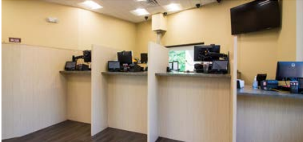
WILLOW CROSSING BRANCH A brand-new teller line and spacious lobby wait to welcome our members.