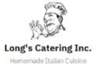
We partnered with Long's Catering to send lunch to the staff at Westmoreland County Food Bank