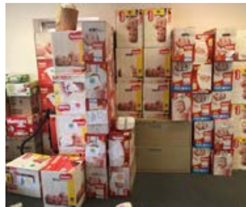
DIAPER DRIVE In May, we held a Diaper Drive benefitting the Western Pennsylvania Diaper Bank. We were able to donate 30 boxes of diapers, as well as a monetary donation, thanks to the generosity of our staff and members. We are also excited to announce that our branch locations are now drop-off locations for the Diaper Bank, so if you missed our drive, you can still drop off diapers at any time and we will pass them along.