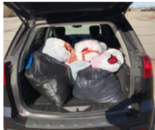
ANIMAL FRIENDS We love our furry friends! Our Community Relations team visited Animal Friends rescue and donated dog food, cat food, treats, leashes and pill pockets.