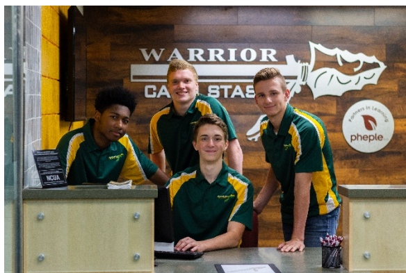
Current staff of the Warrior Cash Stash, a student branch located at Penn Trafford High School in Harrison City, Pennsylvania

Once the students reach high school, the Path continues with more opportunities to learn about Financial Literacy. Teachers can request Pheple FCU’s Financial Literacy Advocate to guest speak in their class; programs offered feature a wide variety of financial topics from managing savings and checking accounts, to the difference between credit unions vs. banks, to credit reports or financial fraud. During their junior year, students are invited to take part in our full Financial Reality Fair. Students are asked to pick a career, research the education requirements and average salary the week before the Fair. An individualized budget sheet is then created for each student to use the day of the Fair, where they visit booths and learn about monthly expenses they will have in the near future, fill out the budget sheets, spin the famous Credit Union “Wheel of Reality,” and visit a financial counselor for feedback.