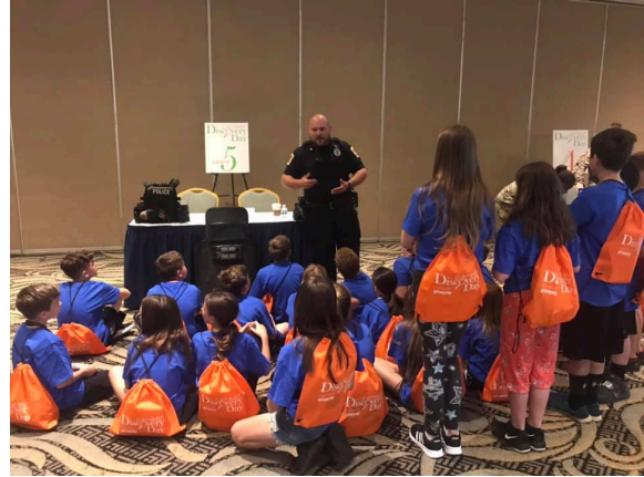
A local police officer speaks to 5th graders during our Discovery Days Career Fair

As we continue the Path into middle school, we give students multiple ways to learn about finances. Our ongoing Cha-Ching! Teen Savers Program provides our middle schoolers an opportunity to continue to save money with their “Save Day” deposits and chances to win gift cards. One of our milestone steps along the Path is our 8 th Grade Mini Reality Fair. Pheple FCU works with middle school guidance counselors to not only educate and introduce students to budgeting, but also help the schools meet some of their educational requirements. Our 8 th Grade Mini Reality Fair uses credit union staff members to speak to students about real life expenses during a rotational classroom setting, and wrapping up with a financial counselor to see how well they completed their first look at budget sheets.